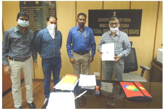
Glimpse of the MoU signed between CCRAS, New Delhi and National Medicinal Plant Board (NMPB) on 20 th April, 2021

A Memorandum of Understanding (MoU) was signed between CCRAS, New Delhi and National Medicinal Plant Board (NMPB) on 20 th April, 2021 for extending mutual cooperation in the field of ‘Medicinal Plants Research and Translation of Research Outcomes’ for a period of 5 years. The Council contributed in the development of guidelines for Ayurveda Practitioners for COVID-19 patients in home isolation and Ayurveda preventive measures for self care during COVID-19 pandemic.