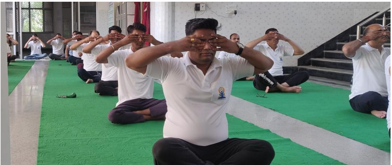
The institute staff practicing Yogasana on the eve of celebration of IDY-2021 at RARI, Jammu