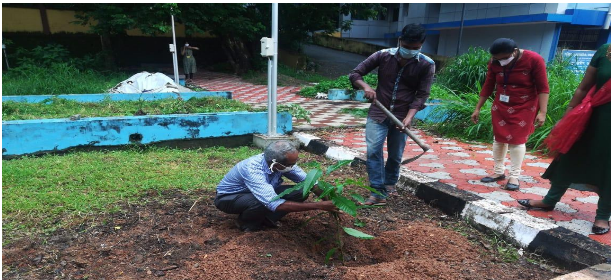
Glimpse of plantation of medicinal plant at RARI, Thiruvananthapuram on the occasion of World Health Day.