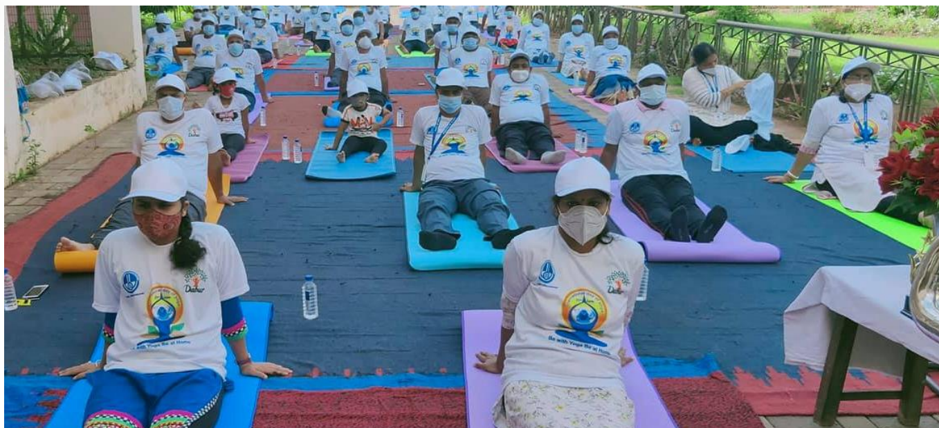
CARI, Bhubaneswar organized Yoga session among officials and staff of the institute on the eve of IDY 2021.