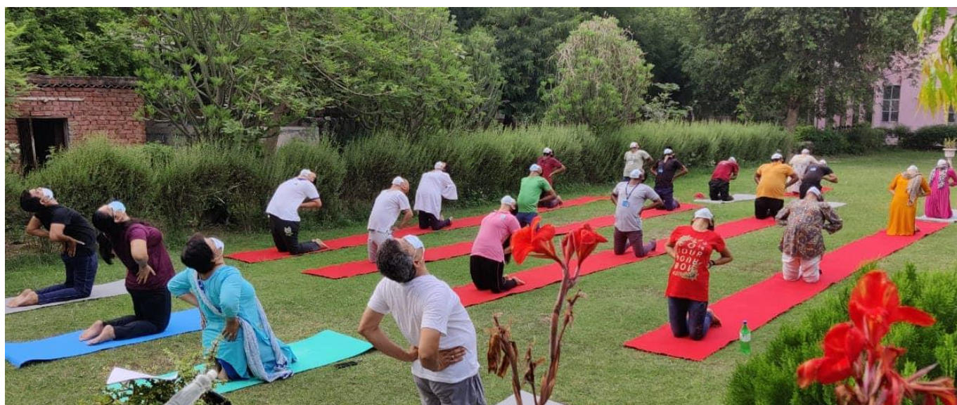
CARI, New Delhi celebrated 'International Day of Yoga-2021' by performing Yogasanas following Common Yoga Protocol – 2021 with the active participation of institute officials and staff.

The 7 th International Day of Yoga was observed with the theme 'Be with Yoga, Be at Home' and it brought with it many activities and events that would help usher in Yoga and its numerous health benefits into the lives of people. To mark the occasion, the Central Council for Research in Ayurvedic Sciences (CCRAS) along with all the peripheral units, keeping the current surge in Covid-19 in mind organized various activities. Glimpse of some of the activities are: