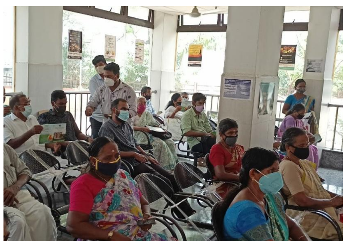
Glimpse of awareness session organized on the occasion of 'World Health Day' in the institute OPD at NARIP, Cheruthuruthy.