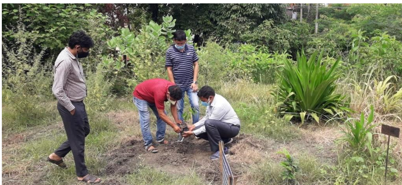
Glimpse of plantation of medicinal plants on the occasion of World Environment Day in the Herbal Garden of CARI, Guwahati

World Environment Day was celebrated on 5 th June, 2021. As a part of the celebration, various activities were organized in the Council as well as at all the peripheral institutes of CCRAS. Glimpse of some of the activities are: