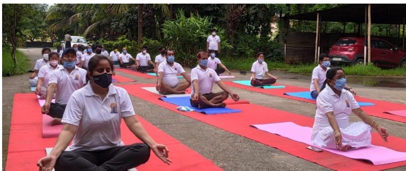
Performing Yogasanas with the active participation of institute officials & staff at Central Ayurveda Research Institute (CARI), Guwahati on the occasion of 7 th International Day of Yoga - 2021.