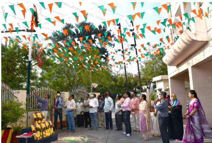
Glimpse of Flag hoisting ceremony at NCIMH, Hyderabad on the occasion of 72 nd Republic day.