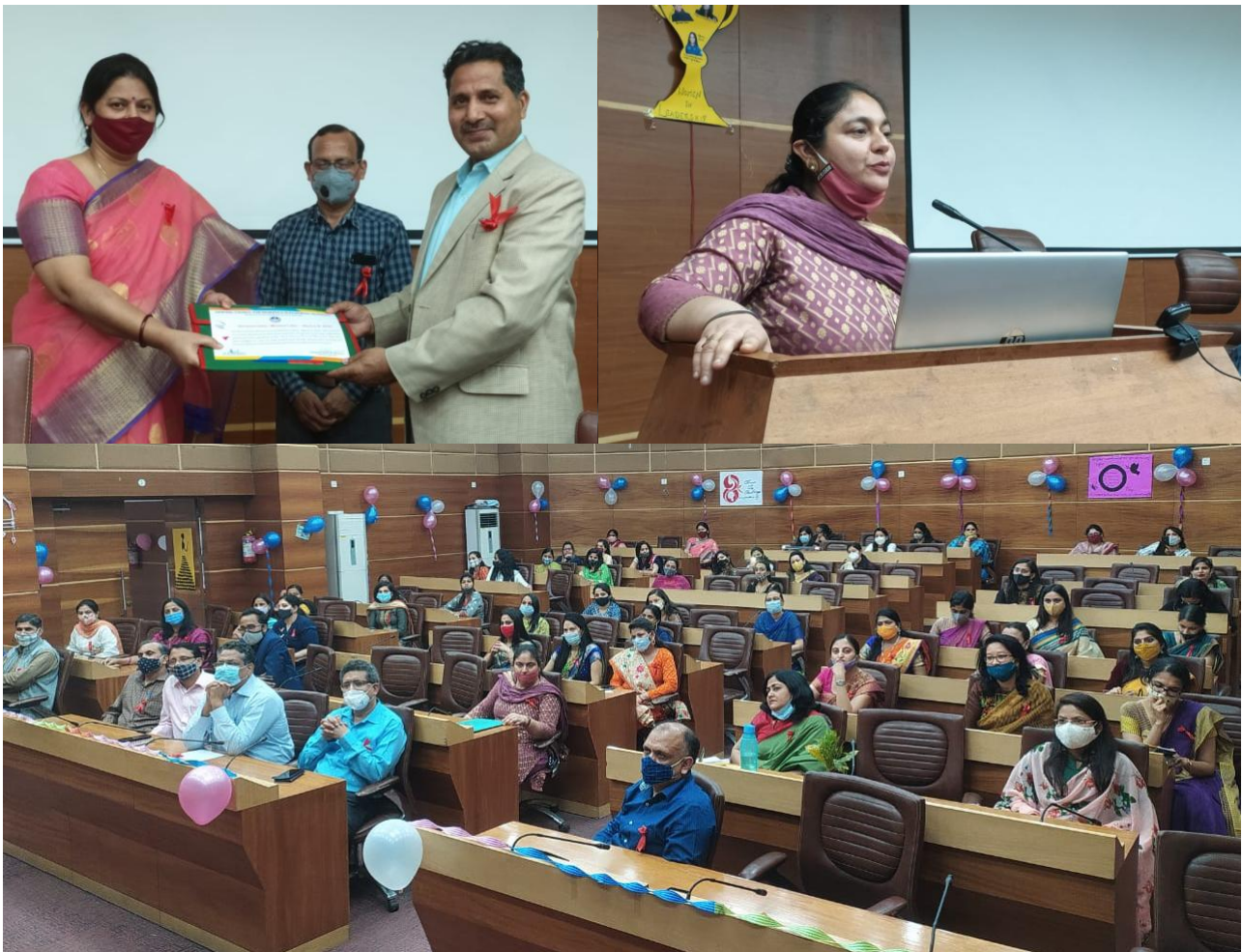
Glimpses of International Women's Day Celebrations at CCRAS, Headquarters, New Delhi