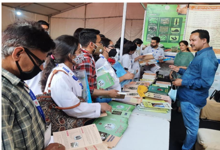
Visitors at CCRAS publication stall during Ayurveda Parv 2021, at Dayanand Ayurvedic College, Jalandhar, Punjab

Central Ayurveda Research Institute (CARI), Patiala, on behalf of CCRAS participated in ‘Ayurveda Parva-2021’ organized by Dayanand Ayurvedic College, Jalandhar, Punjab and sponsored by All India Ayurved Congress, Punjab & Chandigarh Board of Ayurvedic and Unani Systems of Medicine, Punjab and Guru Ravidas Ayurved University, Hoshiarpur. The event was held from 19 th March, 2021 to 21 st March, 2021 in which various Stalls were organized like Information Cell, display and distribution of IEC, sale of CCRAS Publication etc.