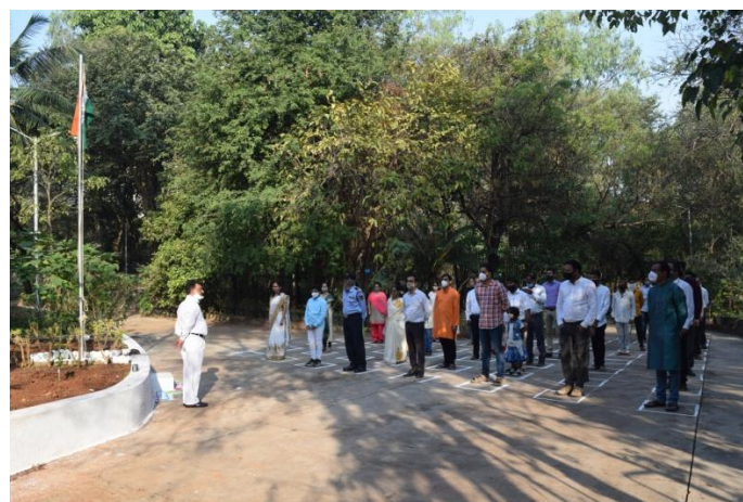
Glimpse of Flag hoisting ceremony at RARI, Pune on the occasion of 72 nd Republic day.