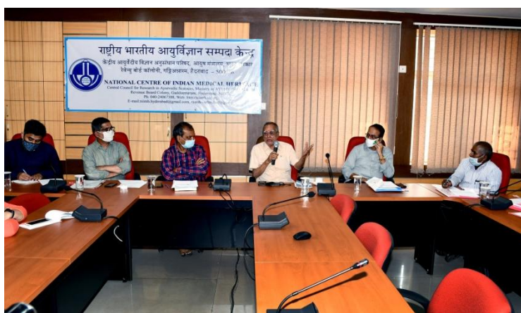
Glimpse of experts of history, Heritage Museum & epigraphic and Research Scholars during ‘Brain Storming Meeting on Inscriptions of Medical Importance in Telangana and Andhra Pradesh’ at NCIMH, Hyderabad