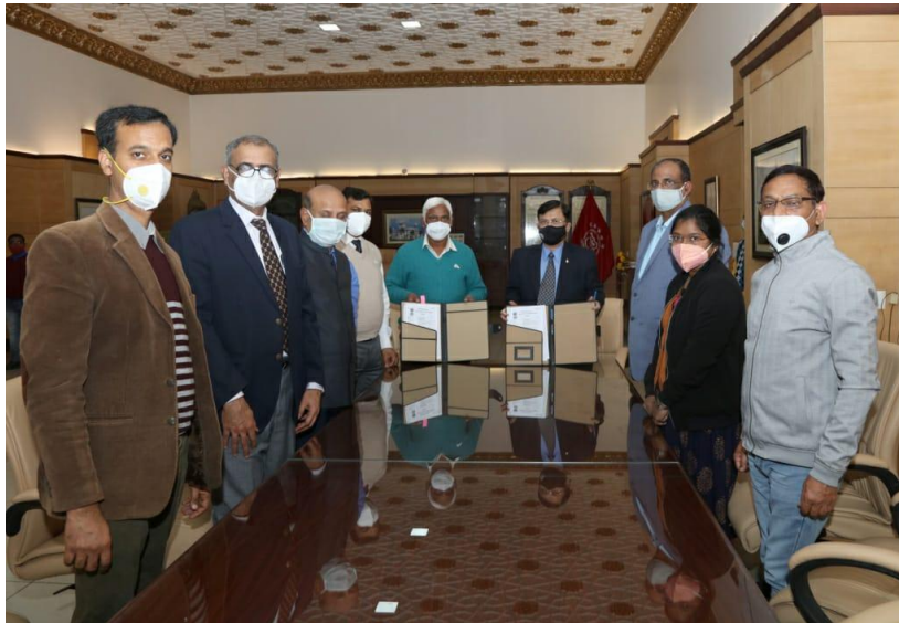
An MoU signed between RARI, Lucknow and KGMU, Lucknow for prophylactic study on Chyawanprash on 7 th January, 2021.