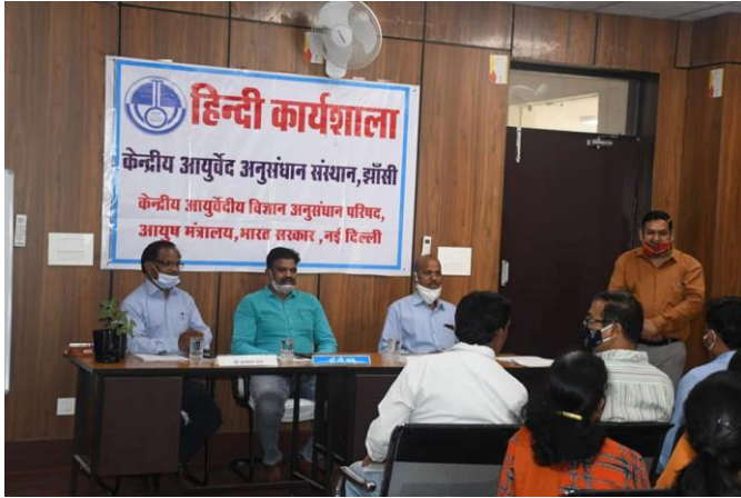
Vies of Hindi workshop organized on the topic 'राजभाषा हिंदी से सम्बंधित कार्यो के सरलता पूर्वक निष्पादन हेतु' on 18 th March, 2021 at CARI, Jhansi

The Council has been known for the implementation of the Official Language Policy of the Official Language Department. As part of this venture, Hindi Karyashala was organized by all the peripheral Institutes of the Council. Glimpse of some of the activities are: