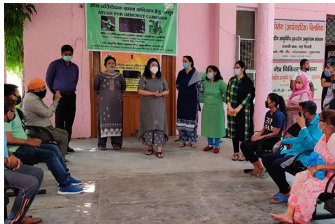
View of various awareness sessions delivering during 'AYUSH for Immunity Campaign' at CARICD, Delhi

'Ayush for Immunity' Campaign was observed in the institute from 10 th September, 2020. Various awareness sessions were conducted on regular basis to OPD patients for boosting their immunity and keeping their body healthy. Demonstration of medicinal plants was also organized in the institute.