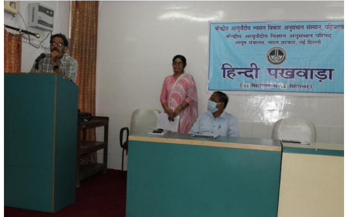
View of Hindi Divas celebrations at CARIRD, Patiala