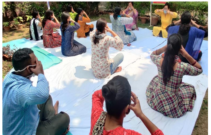
Yoga Camp was organized at CARICD, New Delhi as a part of Poshan Maah on 15 th September, 2020