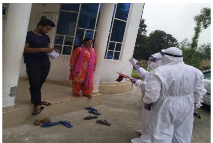
The team of experts from RARIND, Mandi conducting Prophylactic Study in COVID-19 containment zone of Joginder Nagar, Mandi