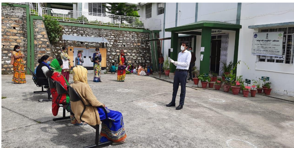
View of public lecture delivering during AYUSH for Immunity Campaign at RARI, Ranikhet

Various activities related to the 'AYUSH for Immunity' campaign were organized by Regional Ayurveda Research Institute, Ranikhet from 8 th September, 2020. Public lectures on different topics related to 'AYUSH for Immunity' delivered by the officers of the institute. Ayurveda based counseling and lifestyle advocacy for boosting Immunity through O.P.D. services were provided to the patients who had visited the institute for their health-related problems. Medicinal plants having immunomodulatory properties were exhibited in the OPD premises, to make aware about their identification and uses to the public. Also, a banner regarding the campaign was placed outside OPD premises for creating awareness among patients. Saplings of medicinal plants such as Guduchi, Amlaki etc. were distributed to the patients attending the OPD.