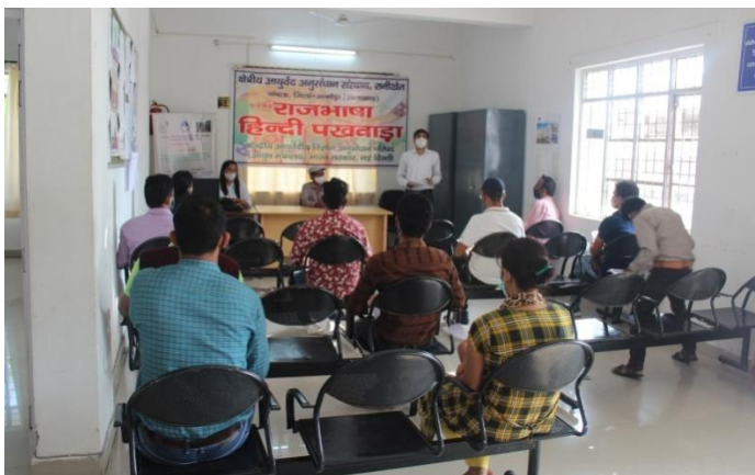
RARI, Ranikhet celebrating Hindi Pakhwada by presenting different Hindi compositions on the occasion of Hindi Divas on 14 th September, 2020