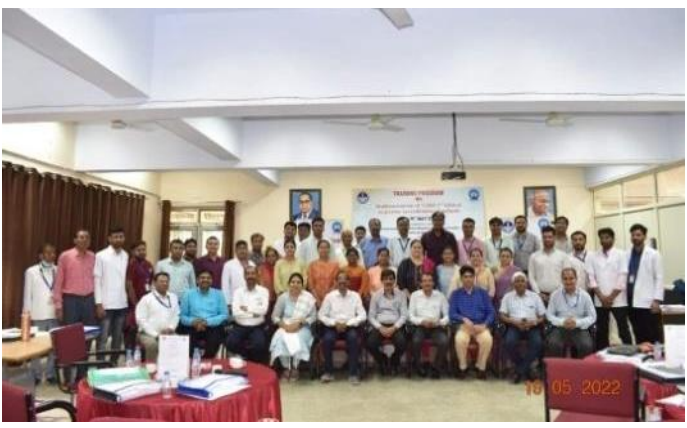
Glimpse of the participants during the NABH training programme organized by RARI, Gwalior in collaboration with the NABH-Quality Council of India from 17<sup>th</sup> to 19<sup>th</sup> May 2022