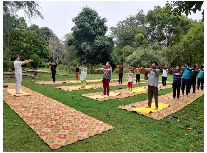
Officers and staff of CARI, Patiala performing asanas on the occasion of 8<sup>th</sup> IDY on 21<sup>st</sup> June, 2022.