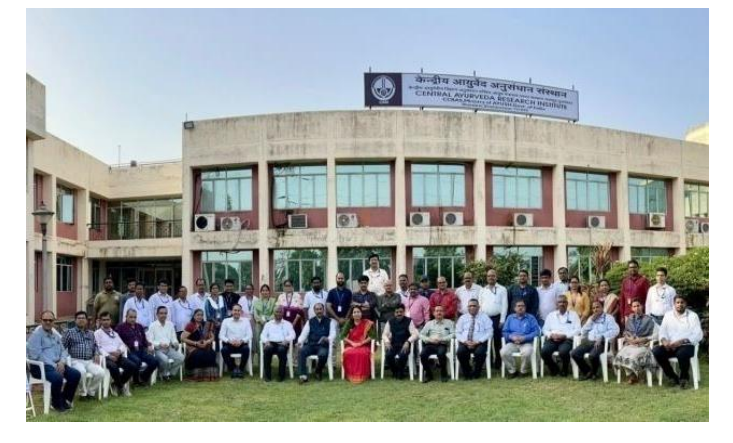
A Training Programme on the implementation of NABH standards for Ayurveda Hospitals was organized by the CARI, Bhubaneswar in collaboration with the NABH-Quality Council of India from 23<sup>th</sup> to 25<sup>th</sup> May 2022