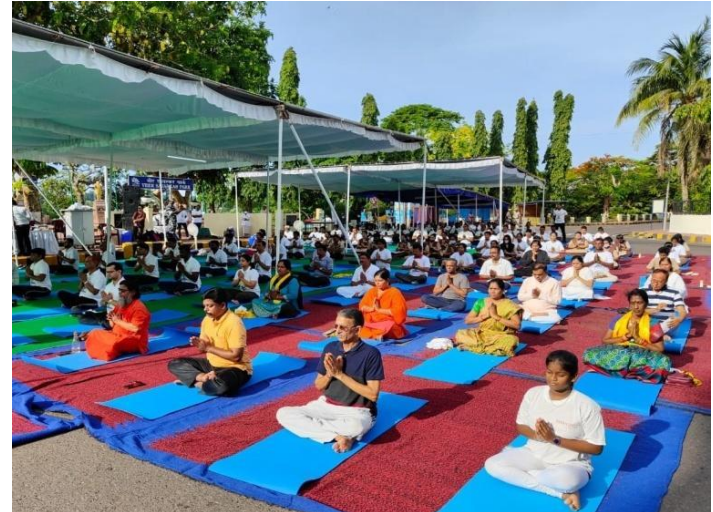
View of RARI, Port Blair participation in the celebration of 8<sup>th</sup> IDY 2022 at National memorial Cellular Jail, Port Blair