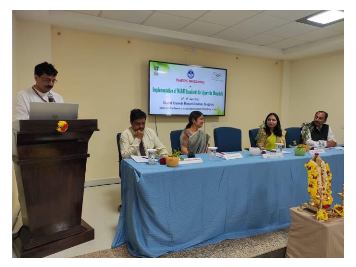
Glimpse of Prof. (Vd.) Rabinarayan Acharya, DG, CCRAS, encouraging all participants to attain NABH accreditation during the training programme on 'Implementation of NABH Standards' organized by CARI Bengaluru from 25<sup>th</sup> to 27<sup>th</sup> April, 2022.