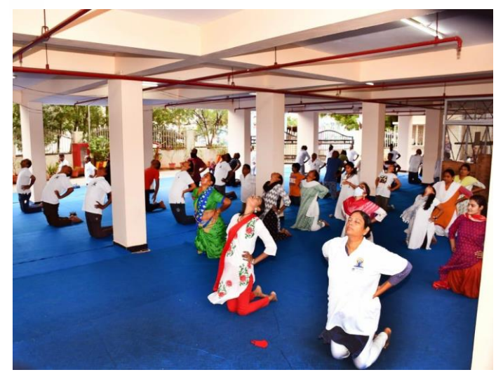
Officials and staff practicing yoga on the occasion of 8^{th} IDY 2022 at NCIMH, Hyderabad on 21^{st} June, 2022