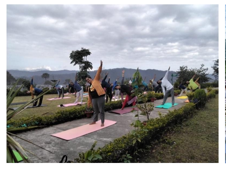
Officers and staff of RARI, Ranikhet, performing Yoga on the occasion of IDY 2022 on 21<sup>st</sup> June, 2022.