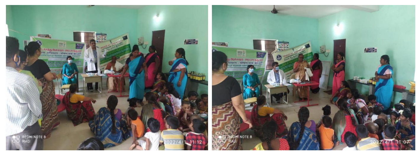
Glimpse of a medical camp and awareness session organised at Anganwadi School, Anakaputhur, Chennai, by ALRARI, Chennai.