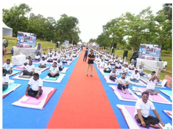
Glimpse of CARI, Bhubaneswar participation at Sun Temple, Konark during the celebration of 8<sup>th</sup> IDY 2022