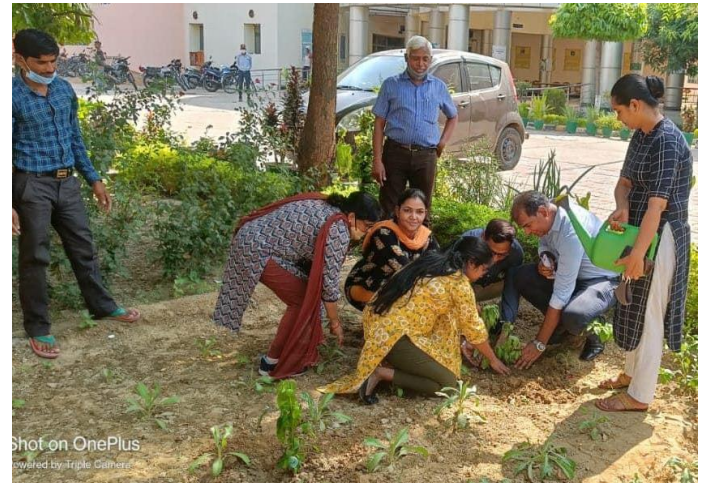
RARI, Lucknow, officials and staff planting saplings of medicinal plant on the occasion of World Environment Day.