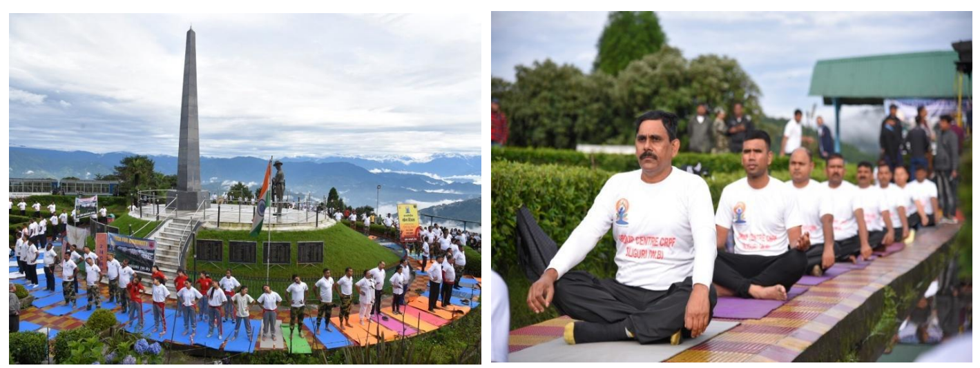
Glimpse of CARI, Kolkata participation in celebration of IDY 2022 at the iconic site named Mountain Railways of India (Darjeeling Himalayan Railways), Batasia Loop, Darjeeling.