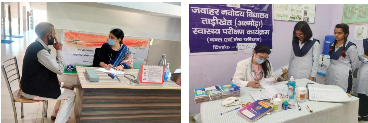
Glimpse of medical team of RARI, Ranikhet providing free medical consultation to the patients of Dol Ashram, Ranikhet and the students of Jawahar Navodaya Vidyalaya, Ranikhet.