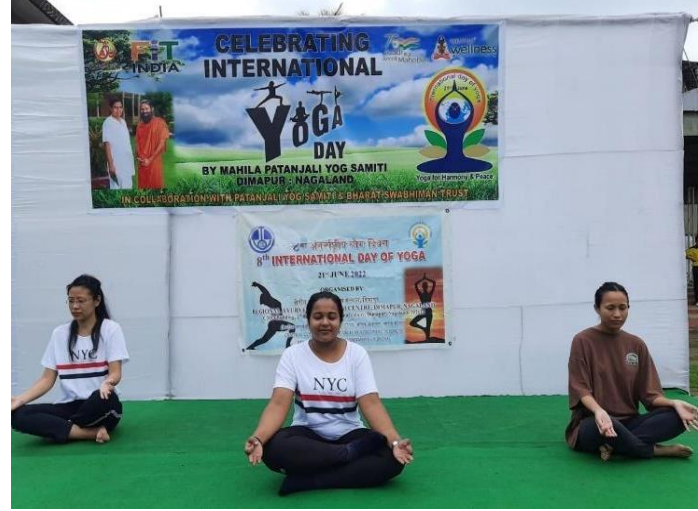
View of RARC, Dimapur participation in the celebration of 8<sup>th</sup> IDY 2022 at Pranab Vidyapith Higher Secondary School on 21<sup>st</sup> June, 2022