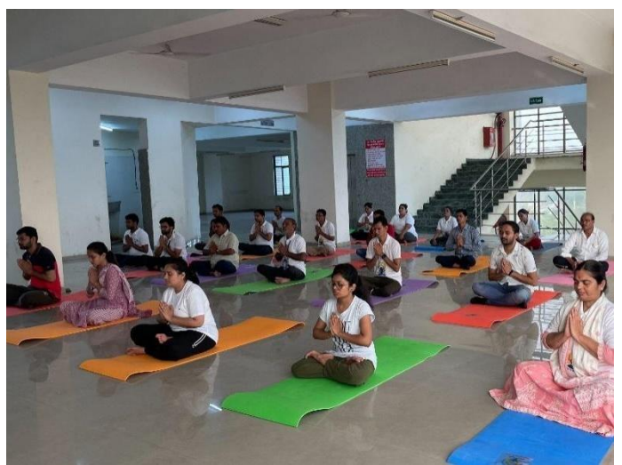
Officials and staff of RARI, Ahmedabad performing yoga in the institute premises on the occasion of 8^{th} IDY 2022

Glimpse of officials and staff performing yoga on the occasion of 8^{th} IDY at CARI, Guwahati on 21^{st} June, 2022