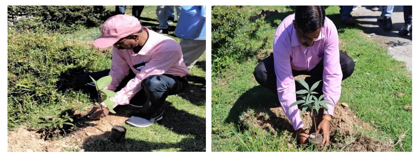
Glimpse of Institute incharge and officers planting the saplings of medicinal plants on the occasion of World Environment Day at RARI, Ranikhet.